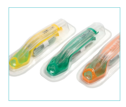
Airway Management • Airway Devices