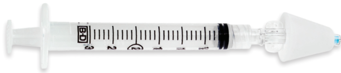
DART with Syringe